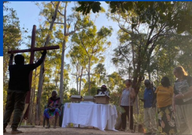
The book launch introduced by the Djambarrpuyŋu men at Dharrwar's open chapel.

You can now purchase your own copy of this book online at www.koorong.com.au