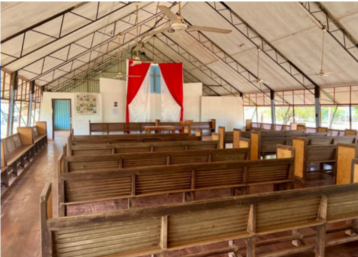
Uniting Church at Yirrkala