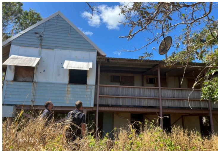
A property at Galiwin'ku, vacant for some time and in need of significant maintenance

This was a timely and informative visit - a time of strengthening relationships - as we seek to work together, serving our communities, to the glory of God.